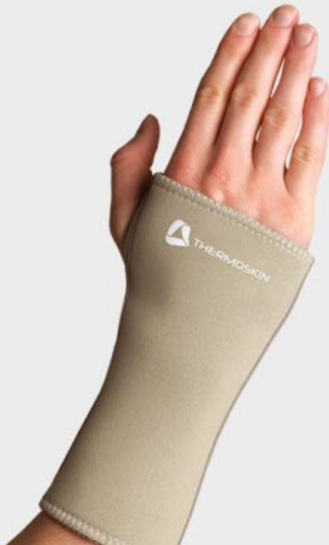
Thermal Wrist Beige Left 8*214 Beige Right 8*215

Provides protection and support for the wrist and lower forearm area. Commonly used for the treatment of sprains, tendonitis and carpal tunnel.