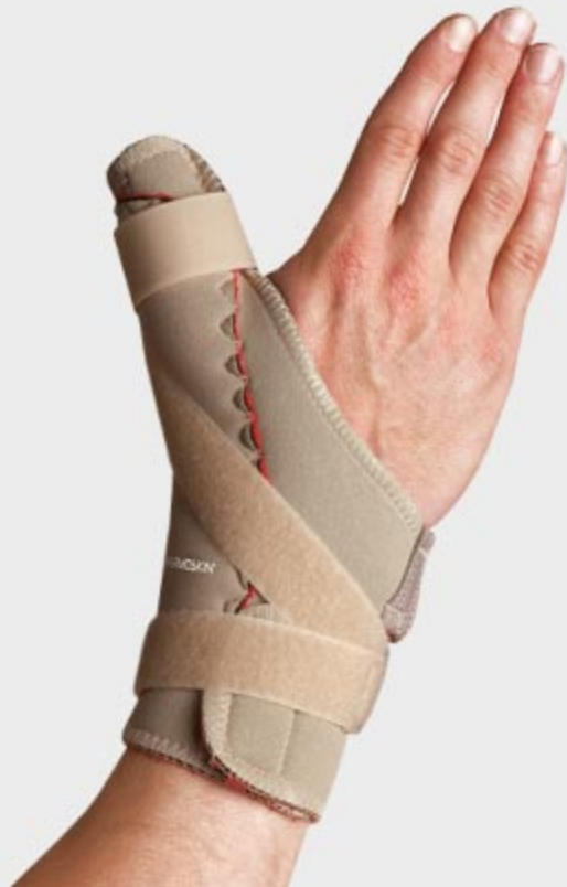
Thermal Thumb Spica Left 8*257 Right 8*258

Heat responsive, mouldable splint combined with thermal material and locking strap provides protection and support to the CMC joint and UCL joint. Commonly used for sports and industrial related thumb injuries.