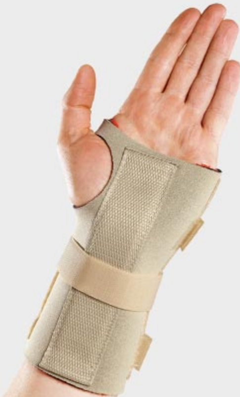
Thermal Wrist Brace Left 8*280 Right 8*281

Provides protection and support for the wrist and lower forearm area. Commonly used for the treatment of sprains, tendonitis and carpal tunnel.