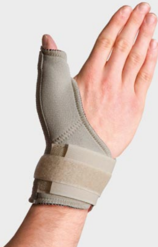
Thermal Thumb Stabiliser Beige 8*271

Heat responsive, mouldable splint combined with thermal material and locking strap provides protection and support to the CMC joint and UCL joint. Commonly used for sports and industrial related thumb injuries.